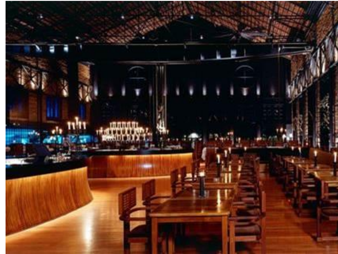
YIN party at KAIS