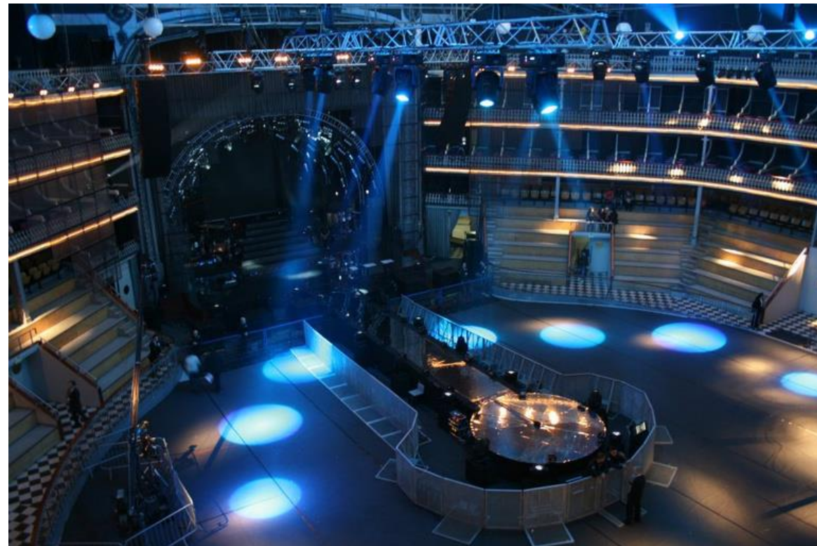
Fado Concert, Coliseu dos Recreios